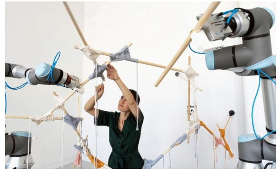
Figure 2: Tie-a-Knot (Mitterberger et al., 2022b).

[2] Tie-a-Knot: The Tie-a-Knot project explores robotic collaboration in manual joining processes, where a robot assists humans in tying wooden elements together using ropes (Mitterberger et al., 2022b). The system employs audio-visual directives and real-time feedback, enabling the robot to refine its construction skills through interaction. The robot's learning capabilities evolve through collaborative experiences, contributing to a dynamic and cooperative workflow. The open-ended design allows for continuous refinement, ensuring that both human and robotic contributions shape the construction process.