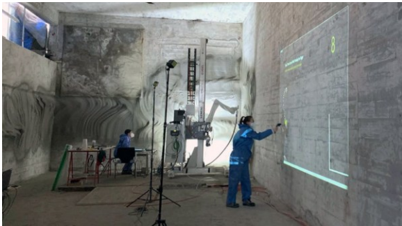
Figure 1: IRoP, interactive robotic plastering system (Mitterberger et al., 2022a).

1) Interactive Robotic Plastering (IRoP): The IRoP project explores human-robot collaboration in plastering through an interactive, adaptive system (Mitterberger et al., 2022a). The robot interprets user demonstrations and executes plastering tasks with minimal explicit programming, allowing for an intuitive and flexible workflow. A hand-held visual display interface enables real-time human input, ensuring a dynamic interplay between human intuition and robotic precision (Mitterberger et al., 2022a; Jenny et al., 2022). One of its key capabilities is continuous scanning and adaptation to surface variations, making it integral to adaptive plastering. While the robot enhances precision and consistency, humans remain essential for interpreting material behaviors, refining application techniques, and managing unexpected variations.