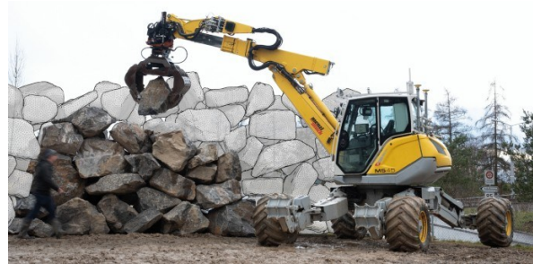
Figure 3: Autonomous Dry Stone Wall Construction (Johns et al., 2020)

3) Autonomous Dry-Stone Wall Construction: The Autonomous Dry-Stone Wall Construction project explores robotic assembly in unstructured environments with heterogeneous materials (Mascaro et al., 2020). The robot demonstrates high operational autonomy, utilizing advanced sensors and heuristic-based planning to autonomously select, place, and stabilize stones without mortar, adapting to irregular material properties (Jud, 2021). While the system is capable of material-driven decision-making, human oversight remains essential for strategic planning, quality control, and adapting to unforeseen challenges. The open-ended design fosters continuous improvement, demonstrating how human-robot collaboration can push the boundaries of autonomous construction while maintaining the flexibility required for real-world conditions.